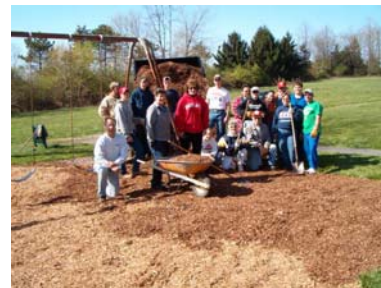
New Market Grange