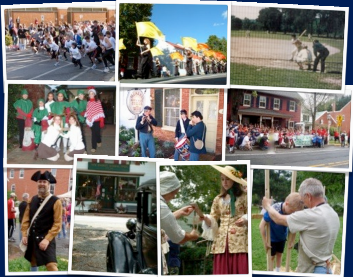
Top Row (L-R): NM Elementary School Annual 5K Fun Run, Linganore High School Homecoming Parade, New Market Baseball Middle Row: Christmas in New Market, Civil War Re-enactors, LUTAA Thanks New Market. Bottom Row: Annual New Market Day Celebration

a complete copy of the snow policy, please visit our website at www.townofnewmarket.org .