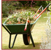
Yard Waste Pick Up Page 2