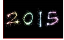
Events March, April, May Page 3-4