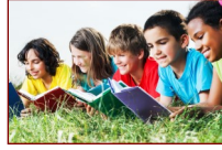
SpiderSmart Workshops Page 2