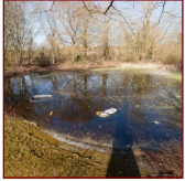
Message from the Mayor Page 1