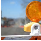
Streetscape Update Page 2