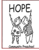
New Preschool Open Page 2