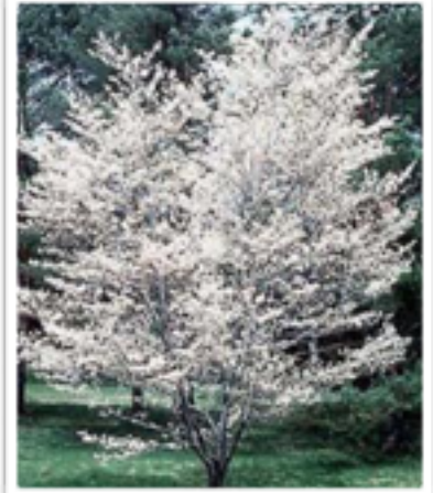
Autumn Brilliance Serviceberry

We are almost there. Please remember for up-to-date information check out our website ( www.townofnewmarket.org ) or FaceBook page (@NewMarketMD).