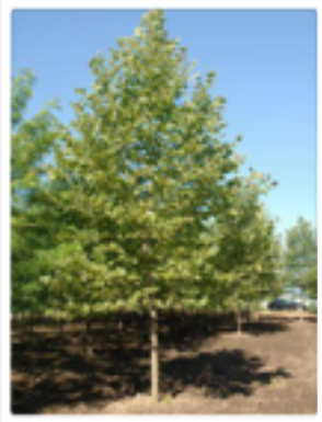
Bloodgood London Planetree

store front accessible from the road. The finishing touch with the brick will be the polymeric sand. This type of sand will lock the bricks together to prevent weeds, debris, and other items getting between the bricks.