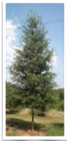
Hightower Willow Oak