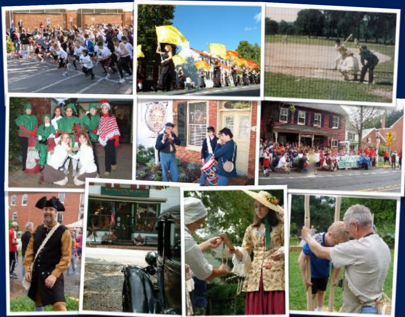
Top Row (L-R): NM Elementary School Annual 5K Fun Run, Linganore High School Homecoming Parade, New Market Baseball Middle Row: Christmas in New Market, Civil War Re-enactors, LUTAA Thanks New Market. Bottom Row: Annual New Market Day Celebration

hundred ($100.00) dollars. For a complete copy of the snow policy, please visit our website at www.townofnewmarket.org .