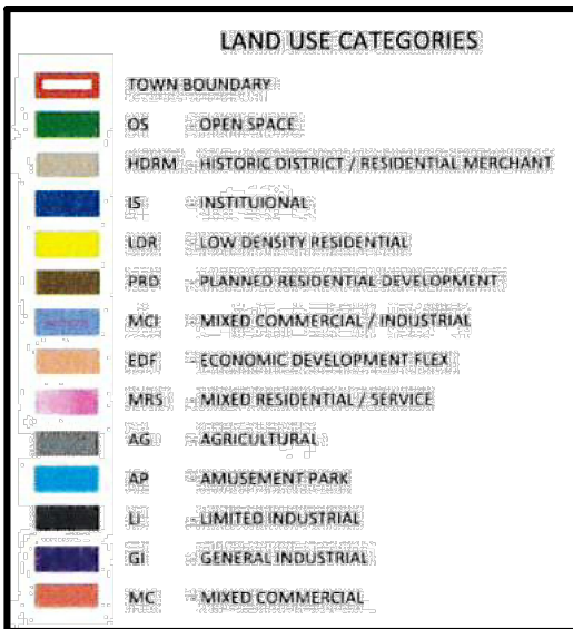
EXHIBIT E - TOWN OF NEW MARKET MASTER PLAN