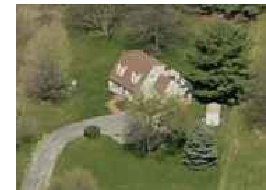
137 W Main St 2 Story Single Family Home ±20-22' with roof peak, ±30'