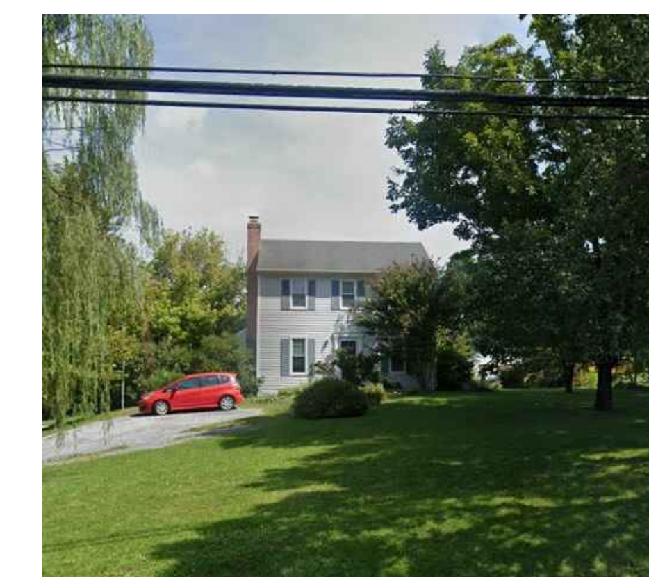
135 W Main St 2 Story Single Family Home ±20-22' with roof peak, ±30'